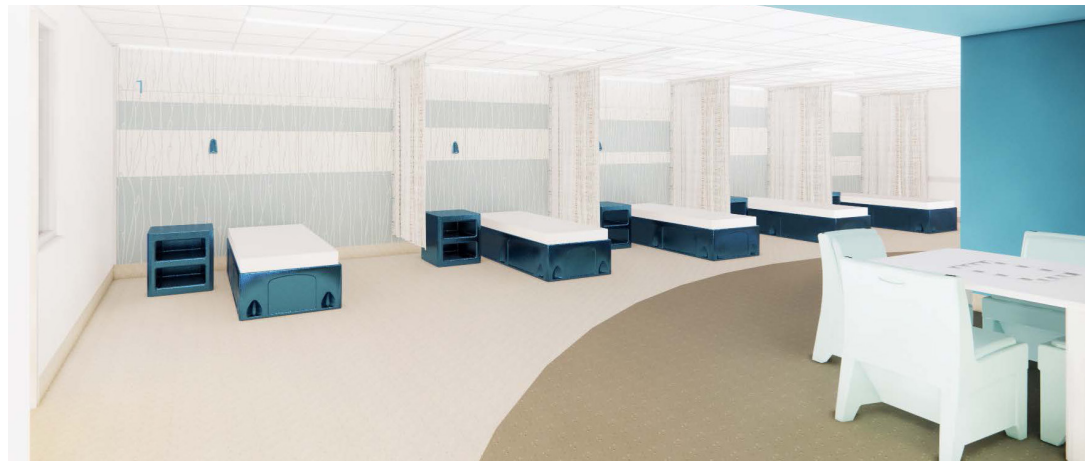
Rendering of renovated Behavioral Health Pod